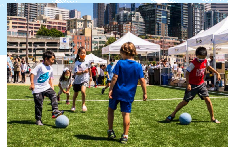
The mini soccer field on Pier 62 has been a big hit with kids and families since it was added in 2021.