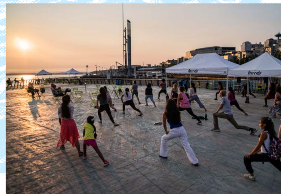
Dozens of people of all ages attended Bollywood dance classes in 2021.