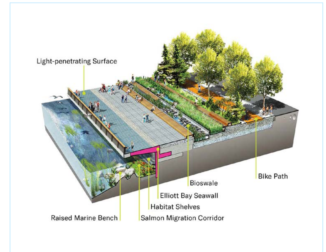
The new Tideline Promenade and seawall were carefully designed to create shallow-water habitat for native marine life.

The scientists are glad to see their research and ongoing data collection contribute to environmental improvements. "Even though Seattle is a huge city, and there's big problems with trying to improve habitat for salmon, it is possible," says Toft. "Salmon still migrate back and forth along our shorelines. This connection, where freshwater meets saltwater, is just hugely important."