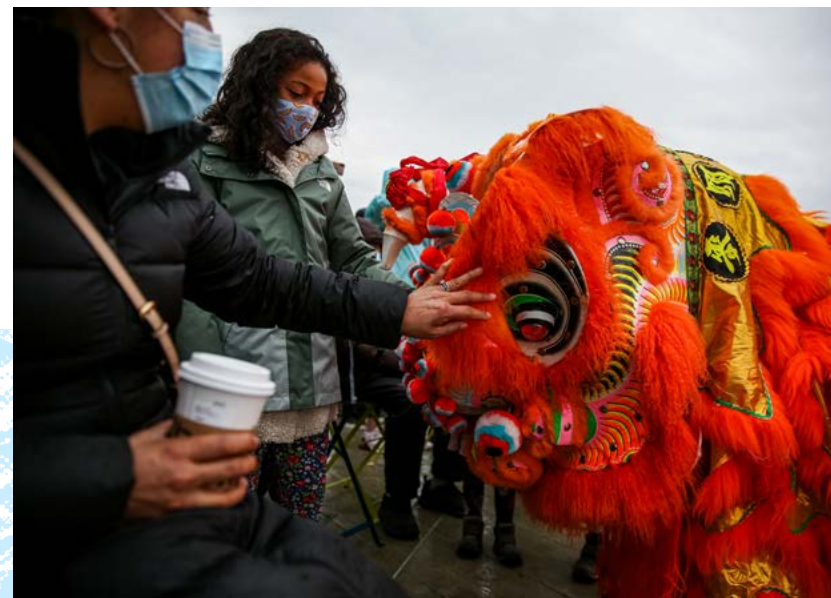
Mak Fai Kung Fu Club's lion dance for Lunar New Year 2022.

Waterfront Park is going to be the largest infrastructure development in our city in a long, long time. It's going to bring the community together. It's going to create new multimodal transportation opportunities for biking, walking, and ferries. I recently spoke to the Seattle Aquarium, and they're doing their own development around the park that's going to teach about sustainability and ocean life. I also love the sustainability component of the park and how they are building it in a way that protects our sea life. This park is going to be transformative, and I just can't wait.