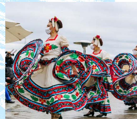
Joyas Mestizas performs at the Día De Muertos Celebration in 2021.