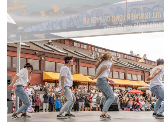
Hot Spot events (2015-2019) were among the earliest free programs we hosted on the old Pier 58.