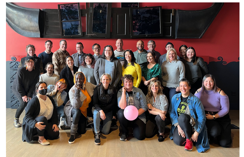
Friends staff at a staff retreat in 2023.