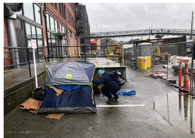
The Evergreen Treatment Services REACH team provides homeless support outreach—part of how we and our partners are redefining public safety along the downtown waterfront corridor.

From office space to hiring, we have made significant changes as an organization to meet the growing needs of programming, operations, fundraising, and public safety over the years. We went from one staff member in 2013 to a team of 27 full-time employees by the end of 2022.