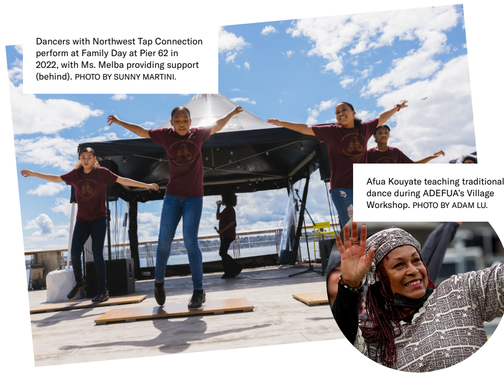
Dancers with Northwest Tap Connection perform at Family Day at Pier 62 in 2022, with Ms. Melba providing support (behind).