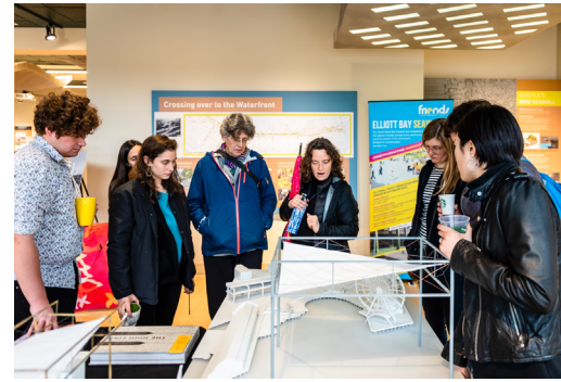
Waterfront Space was a place for constant public engagement, where folks of all ages and demographics could come in and share their thoughts and hopes for the new Waterfront Park.

Friends has been piloting programs and operations along the waterfront since 2013. Early “Hot Spots” programs were held on the old Pier 58, where we welcomed over 20,000 guests for performances, classes, and cultural events. Since the new Pier 62 opened in the fall of 2020, we have continually expanded programming and operations there, deepening partnerships with program partners from across the city through a co-design model. These programs have enabled us to provide inclusive waterfront experiences for people of many cultural backgrounds, centering historically excluded communities like Black, Indigenous, and People of Color and ensuring that Waterfront Park is a park for all.