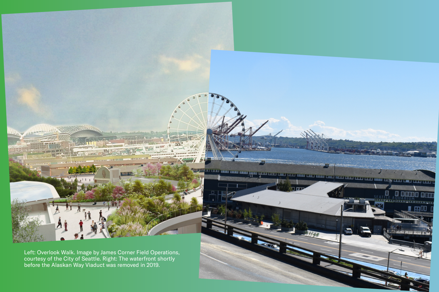
Left: Overlook Walk. Image by James Corner Field Operations, courtesy of the City of Seattle. Right: The waterfront shortly before the Alaskan Way Viaduct was removed in 2019.