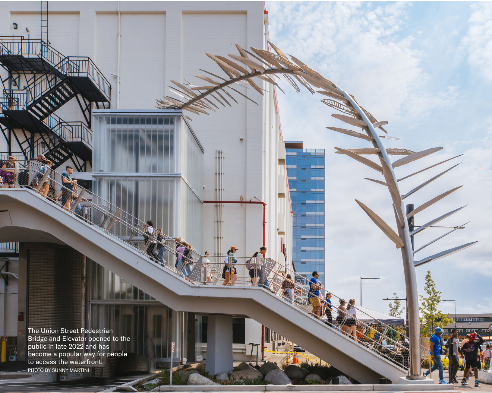
The Union Street Pedestrian Bridge and Elevator opened to the public in late 2022 and has become a popular way for people to access the waterfront.