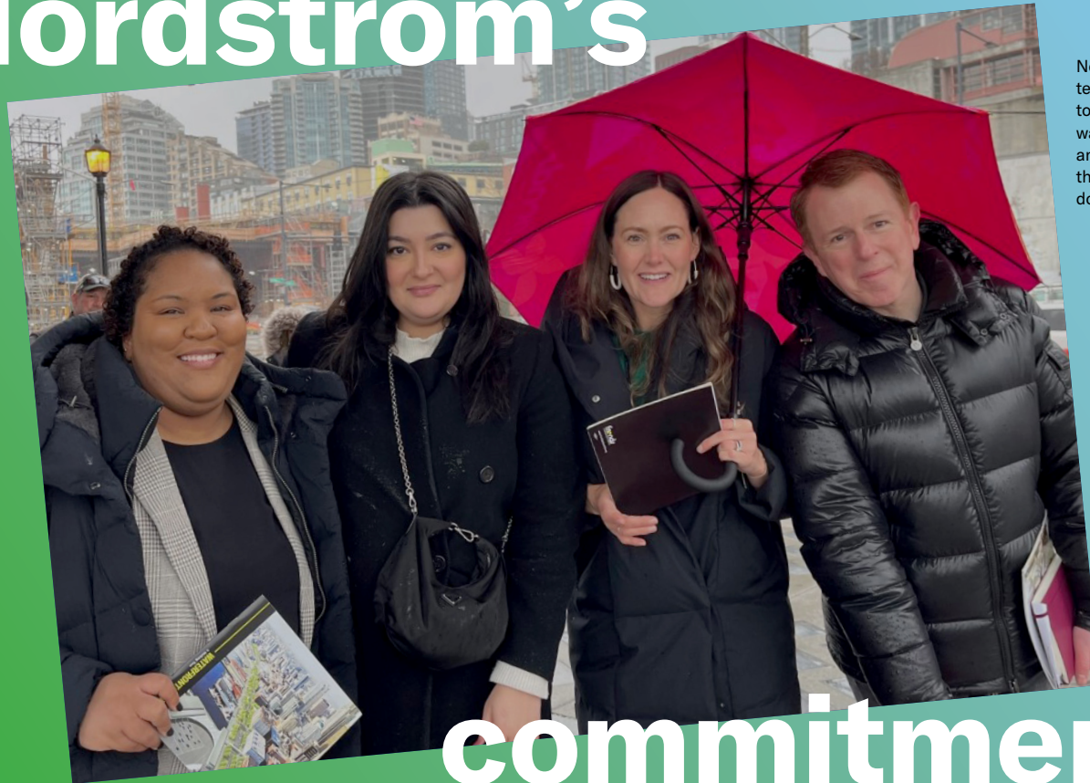
Nordstrom team members tour the Seattle waterfront and explore the future of downtown.