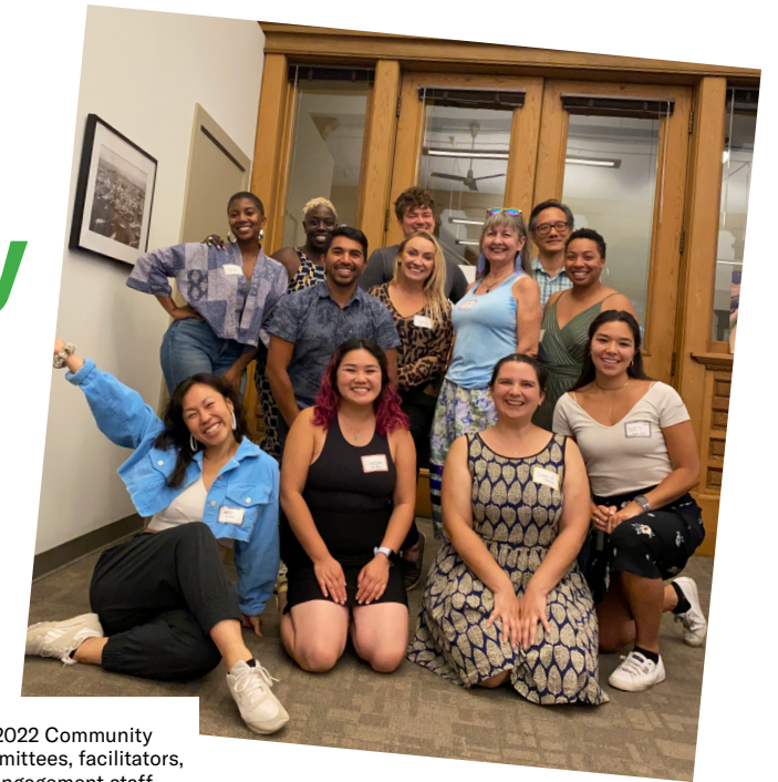
Members of the 2022 Community Partnership Committees, facilitators, and community engagement staff.

In 2022, Friends of Waterfront Seattle piloted two Community Partnership Committees, working to build inclusion and accountability in our organization's equity efforts: the Pulling Together Committee (PTC) and the Community Partnership Committee (C3). Together, these groups give representatives of historically marginalized communities a venue to offer comments, concerns, and ideas on creating a waterfront that benefits people and groups who have historically been left out.