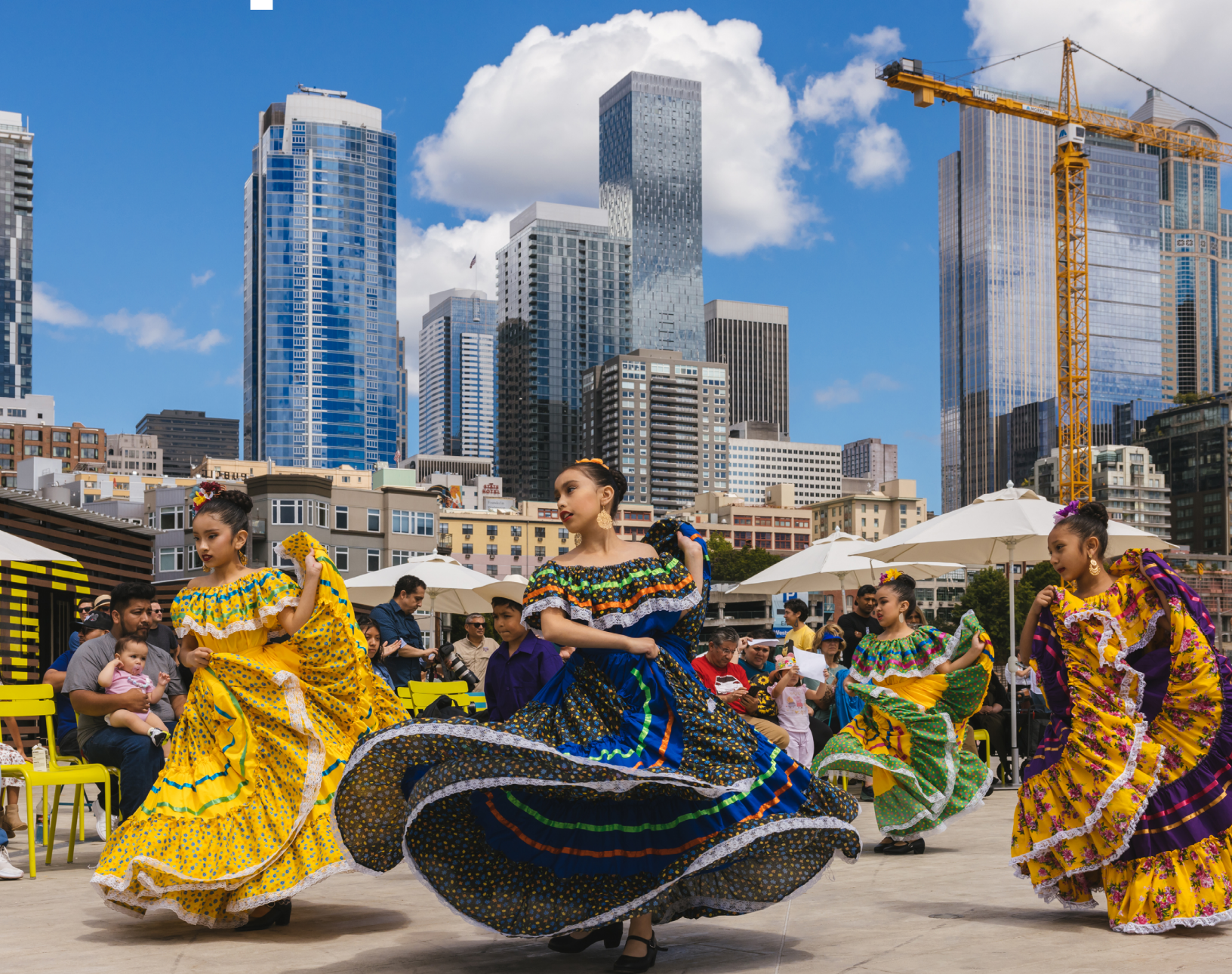
Folklore Mexicano Tonantzin performing at Family Day at Pier 62 in 2022.