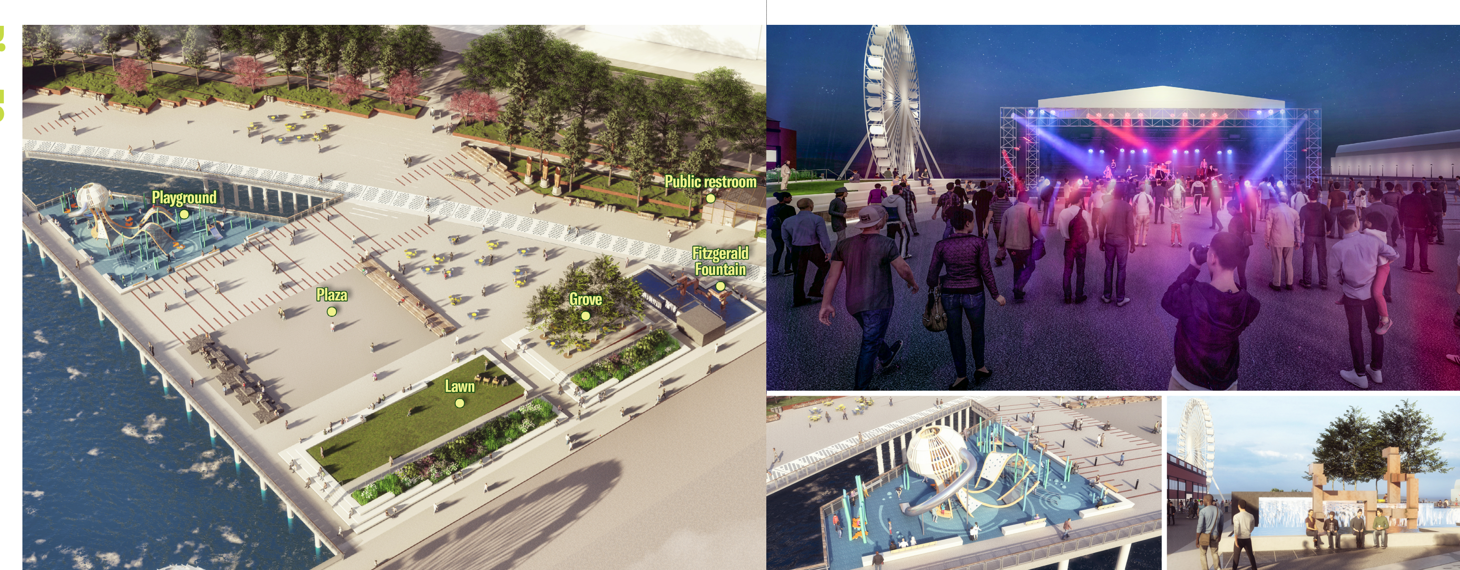
A Place for Gathering, Activity & Play