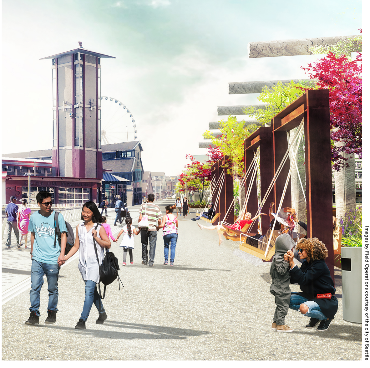
A place for moving, resting, and play, the walkway along the promenade will be punctuated by benches and swings.