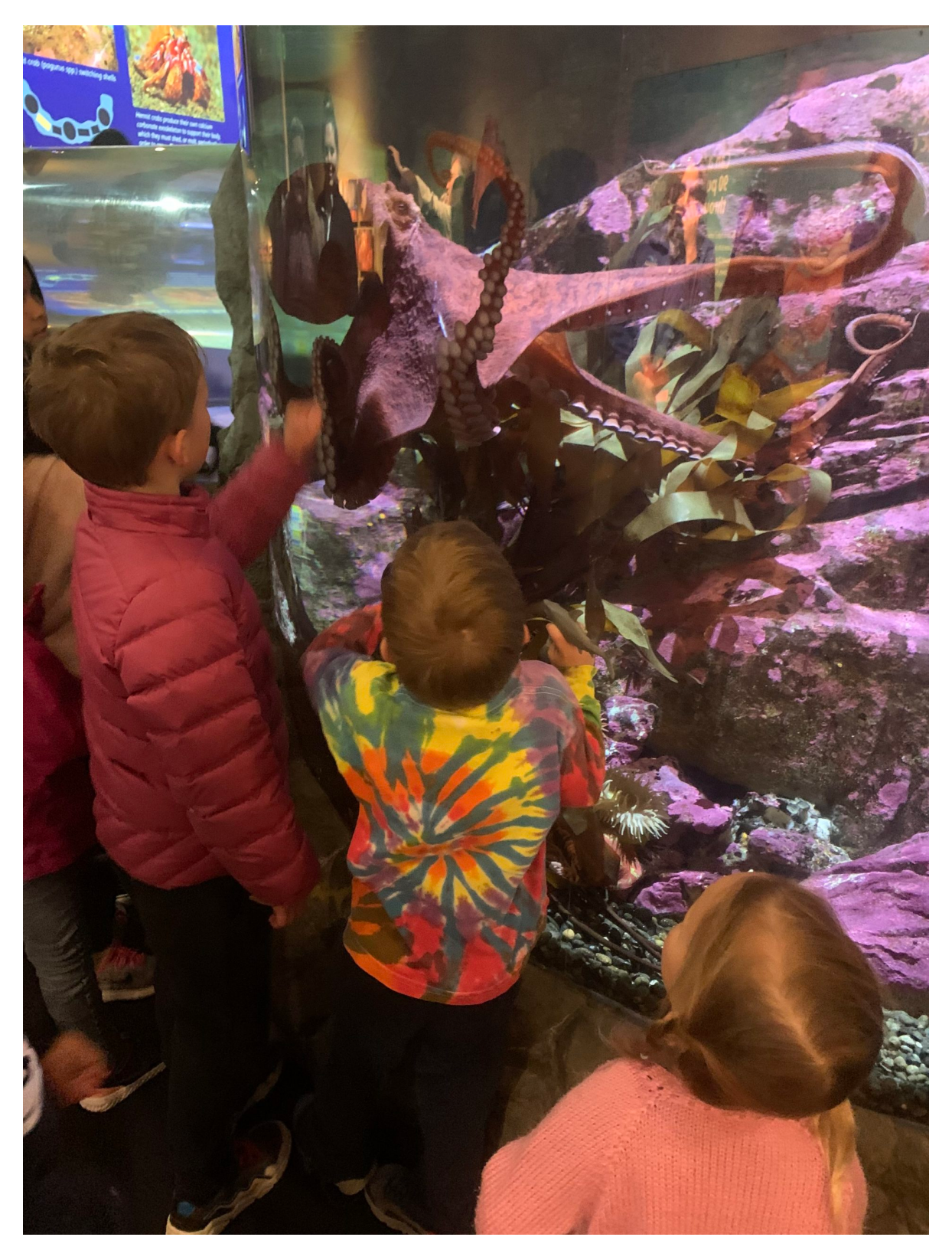
The Giant Pacific Octopus showing off its suckers and gliding by the children.

Another highlight was meeting the newest mammalian addition to