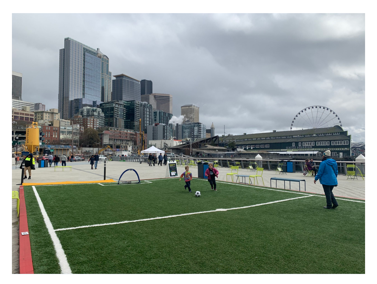
Pickup soccer and other fun and games on Pier 62.