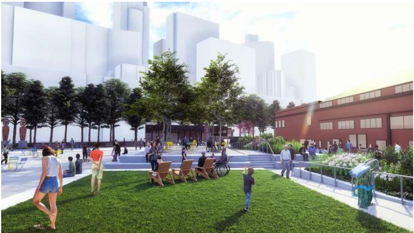
Renderings of the new park at Pier 58. Waterfront Seattle

Friends of Waterfront Seattle announced Thursday a major philanthropic gift of $5 million from Amazon. The funds will support the ongoing construction of Seattle's new 20-acre Waterfront Park , set to be complete in 2024.