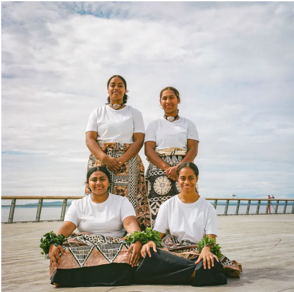
Pasifika Wayfinders for “Reflections.”

“Not everybody had a mutual aid focus, but that part was intentionally woven in with the cultural presentations,” Ingram said.