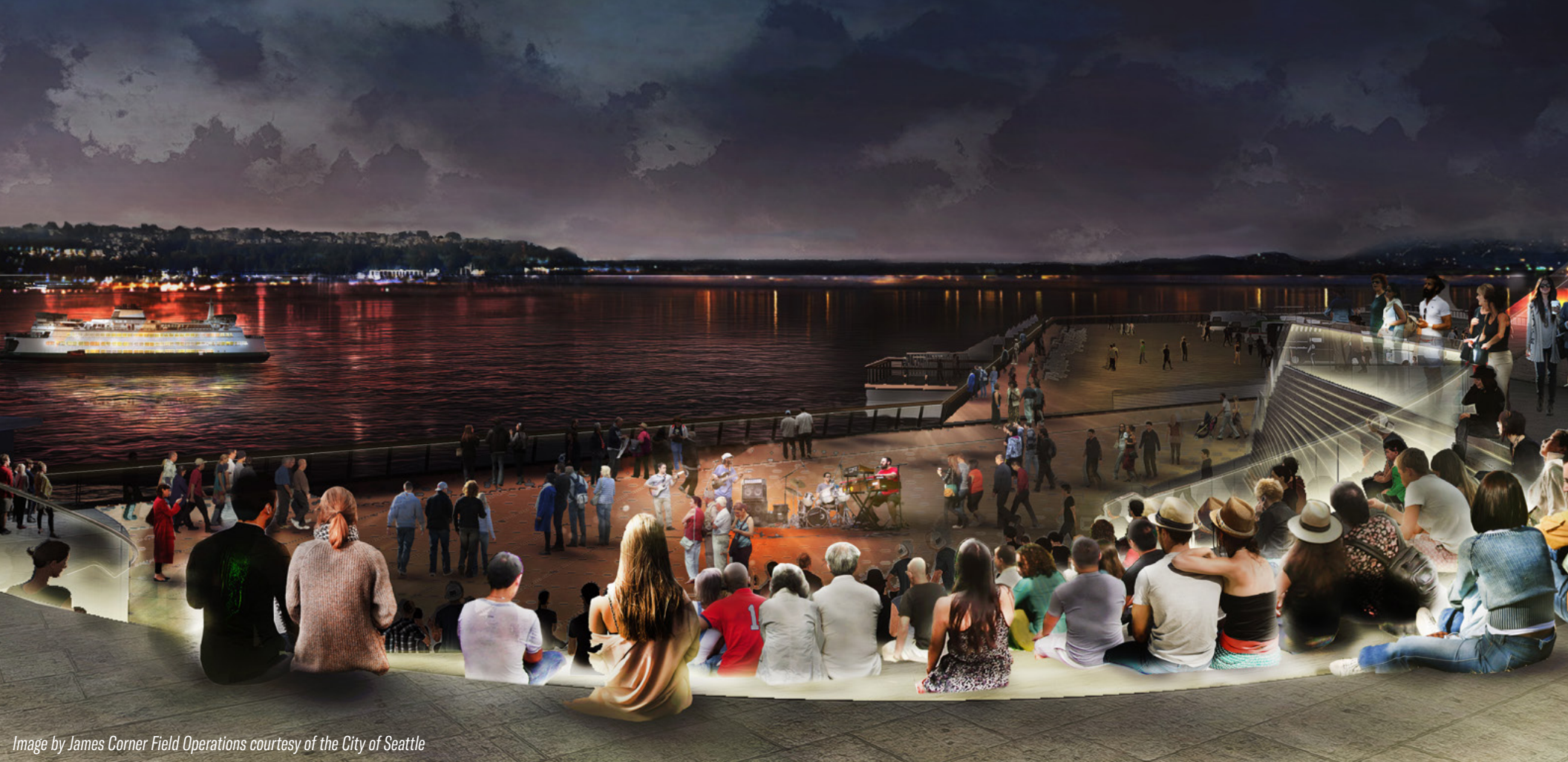
Image by James Corner Field Operations courtesy of the City of Seattle

WELCOMING, BEAUTIFUL, ACTIVE SPACES — ASSURED.