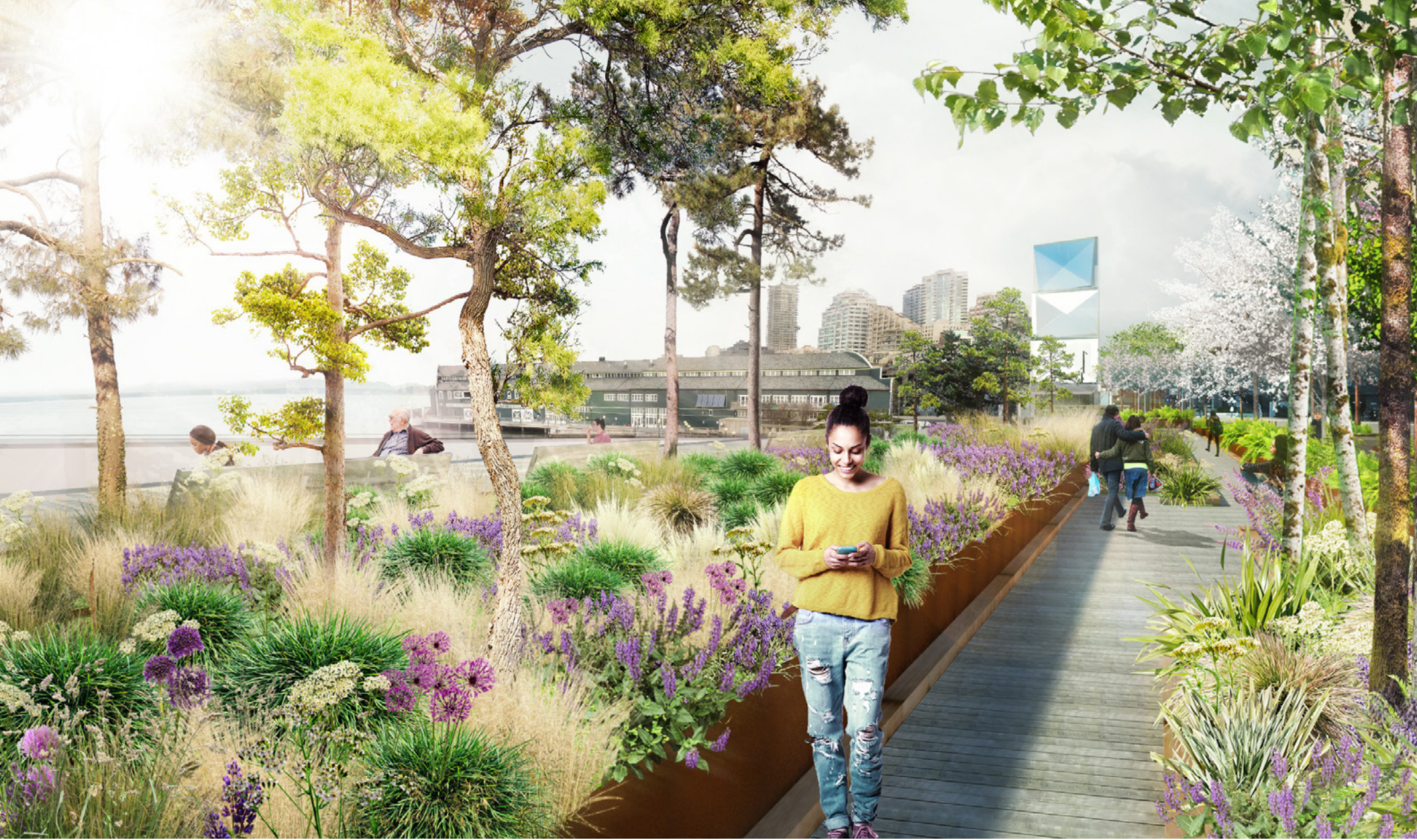
Image by James Corner Field Operations courtesy of the City of Seattle.