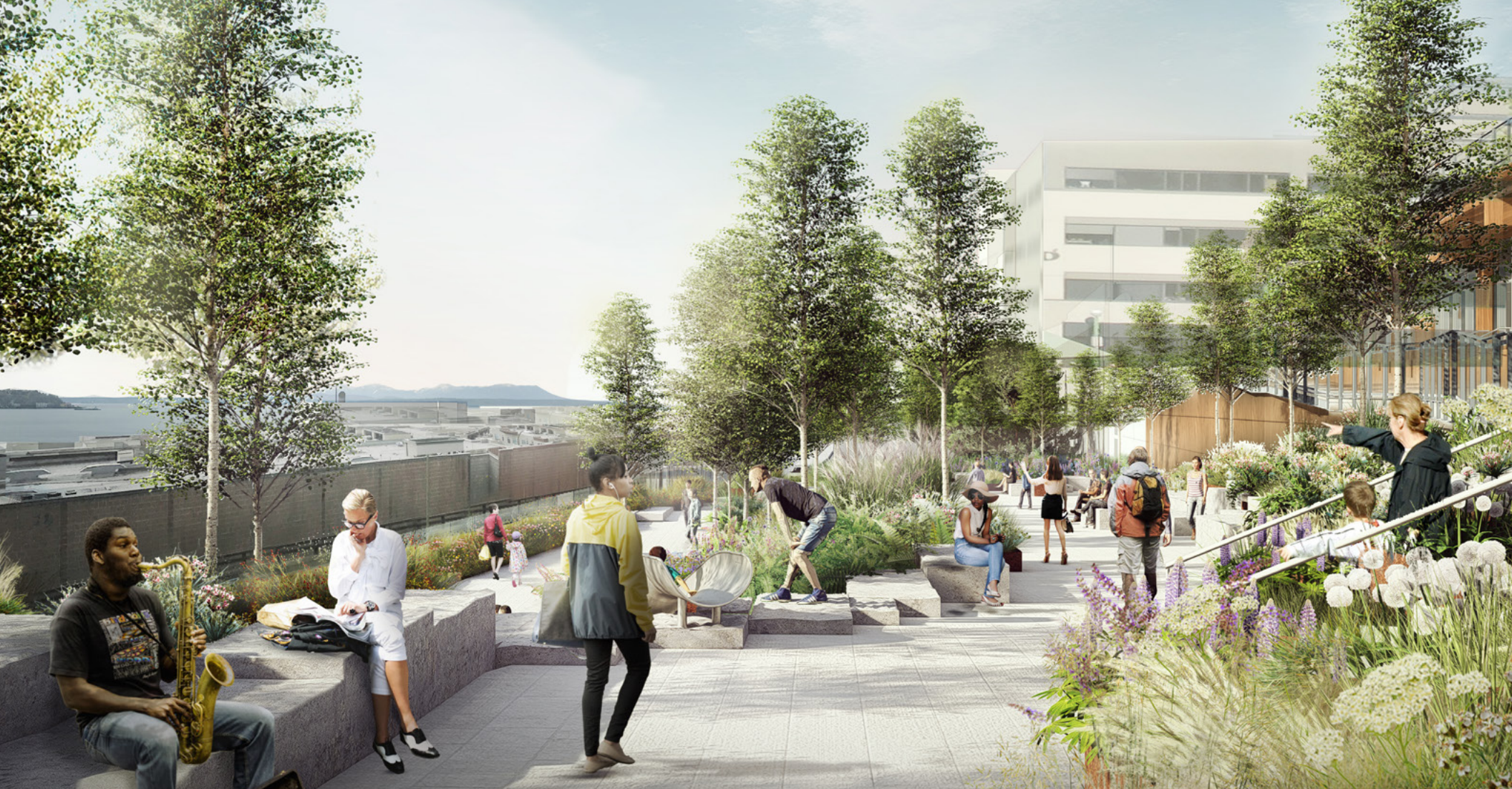
Image by James Corner Field Operations courtesy of the City of Seattle.